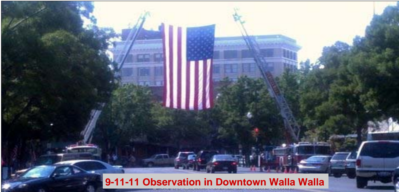
9-11-11 Observation in Downtown Walla Walla