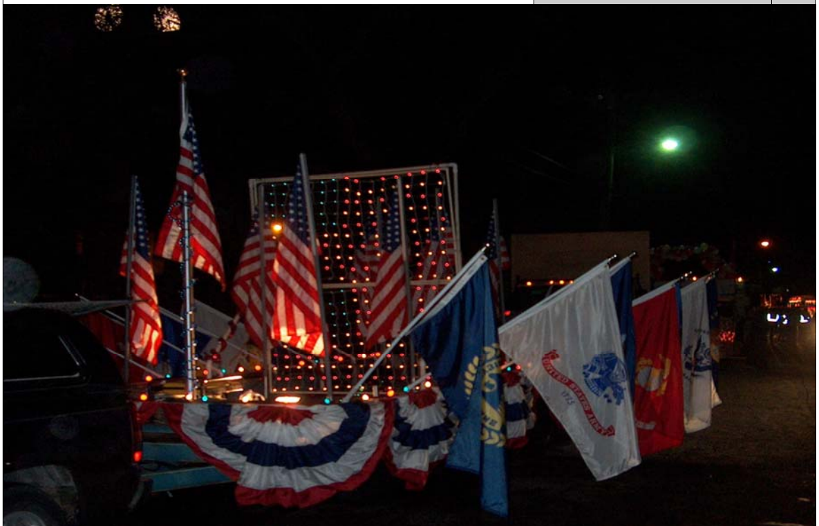
AMVETS Post Eleven-Eleven's entry in Macy's Light Parade held in Downtown Walla Walla on December 4th

NATIONAL HEADQUARTERS 4647 Forbes Boulevard Lanham, Maryland 20706-4380 TELEPHONE: 301-459-9600 FAX: 301-459-7924 E-MAIL: amvets@amvets.org